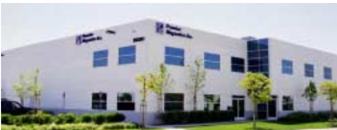
New Premier US Headquarters, Lake Forest, CA

Premier Magnetics phenomenal sales and profit growth continues. Dramatic increase in 2000 represents growth in Communication Products, especially DSL as well as increases in LAN and Power Magnetics.